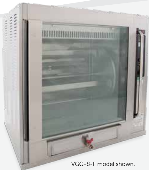
VGG-8-F model shown.

Whether poultry, pork, beef, vegetables, or your own specialty, the VGG-8-C is sure to maximize customer satisfaction and produce uniform, consistent results every time.