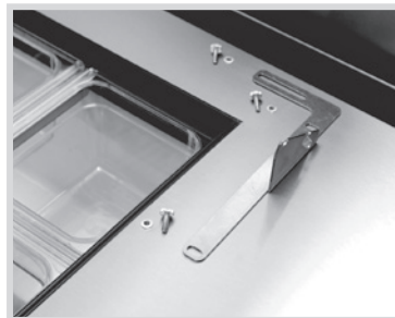
Bracket hardware utilizes existing screw holes.