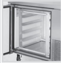
Half Bun Tray Rack