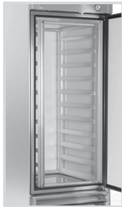
Full Bun Tray Rack

Note: All Accessories Are At Parts Discount