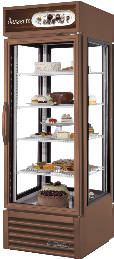
Shown with optional Dessert Sign.

Swing Door Pass-Thru Refrigerator with Hydrocarbon Refrigerant-True Standard Look Version 01