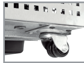
1 1/2" diameter dual swivel castors for "LP" models.