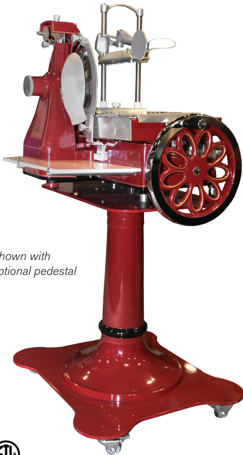
Shown with optional pedestal

This vintage design accomodates tradition-ally over-sized artisan meats with a 14" precision knife. Theater-style, paper-thin slicing with effortless operation.