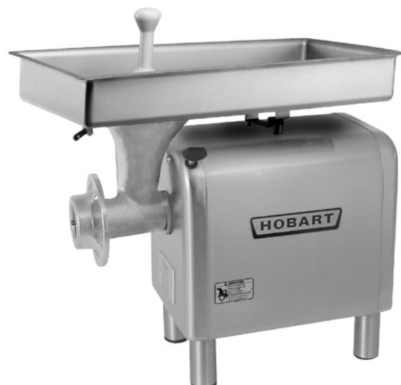
4822 with Optional Funnel Shaped Cylinder