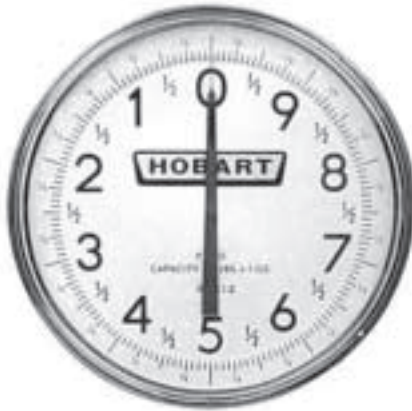
30# x 1 oz. Maximum Capacity 30 lb. Device No. PR30-1