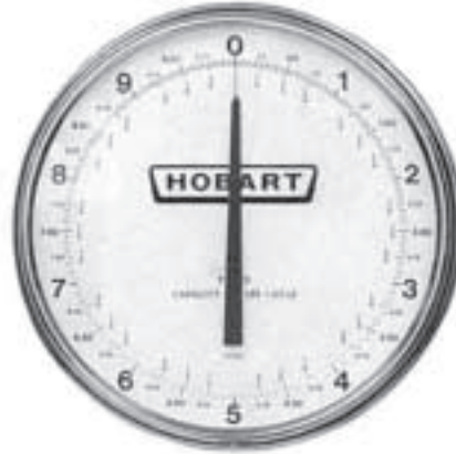
30# x .05 lb. Maximum Capacity 30 lb. Device No. PR30-2

Ideally suited for use wherever Model 5018 or 5018V Checkstand Scales are installed.