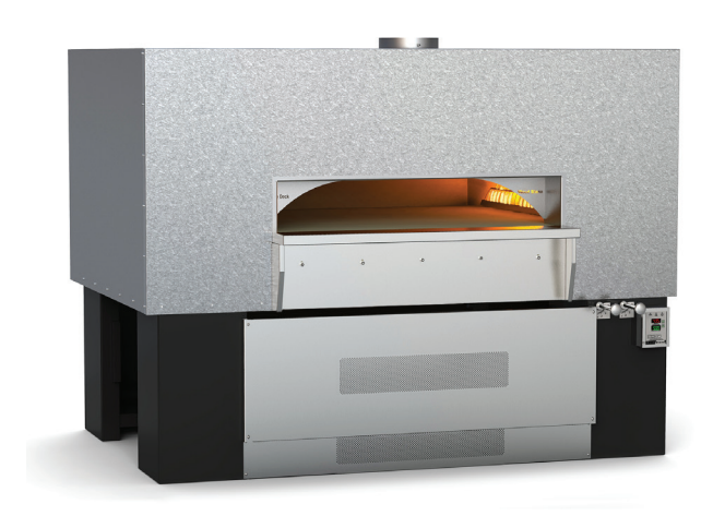
Right/Right-handed configuration shown.