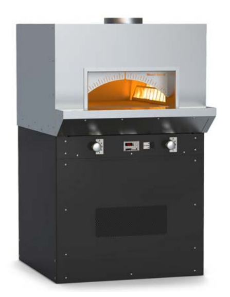
WS-BL-4343-RFG-LR model shown.