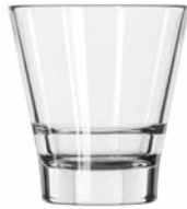
Rocks No. 15710 + 9 oz./26.6 cl./266 ml. H3½ T3½ B2¼ D3½ 1 doz./8# = .45 cu.ft. SCC 367112 TRAEX TR-6B □