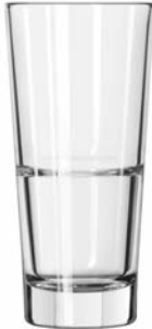
Beverage No. 15713 + 12 oz./35.5 cl./355 ml. H6¼ T3 B2¼ D3 1 doz./13# = .50 cu.ft. SCC 367143 TRAEX TR-12HH □