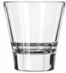
new Espresso No. 15733 + 3.7 oz./11 cl./110 ml. H3 T2¼ B1¼ D2¼ 1 doz./5# = .35 cu.ft. SCC 6943949906986 TRAEX TR-7 □

Pyramiding is still a better way to stack and store glassware. La méthode pyramidale continue d'être la meilleure façon d'empiler et de ranger la verrerie. El apilado en forma de pirámide es todavía una mejor manera de apilar y guardar la cristalería.