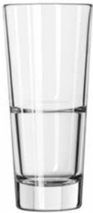
Hi-Ball No. 15711 + 10 oz./29.6 cl./296 ml. H6¼ T2¾ B2 D2¾ 1 doz./11# = .44 cu.ft. SCC 367136 TRAEX TR-7CC □