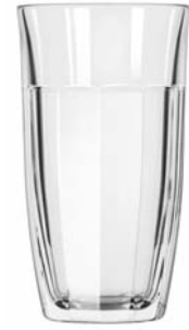
Cooler No. 15370 + 16 oz./47.3 cl./473 ml. H6½ T3¾ B2¼ D3¾ 1 doz./14# • .61 cu.ft. SCC 6943949906160 TRAEX TR-6BBB □