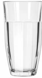
Beverage No. 15366 + 10 oz./29.6 cl./296 ml. H5¼ T3 B1¾ D3 1 doz./9# • .40 cu.ft. SCC 6943949902537 TRAEX TR-12HH □