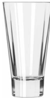
Beverage No. 15825 + 14 oz./41.4 cl./414 ml. H6½ T3½ B2½ D3½ 1 doz./15# • .66 cu.ft. SCC 400116 TRAEX TR-6BBB □