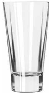
Beverage No. 15824 + 12 oz./35.5 cl./355 ml. H6½ T3¼ B2½ D3¼ 1 doz./13# • .56 cu.ft. SCC 400123 TRAEX TR-6BB □