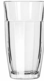
Beverage No. 15365 + 12 oz./35.5 cl./355 ml. H5¾ T3¾ B2½ D3½ 1 doz./11# • .50 cu.ft. SCC 6943949902544 TRAEX TR-12HH □