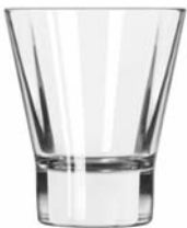
Rocks No. 15821 + 9 oz./26.6 cl./266 ml. H4¼ T3¾ B2¼ D3½ 1 doz./11# • .49 cu.ft. SCC 400208 TRAEX TR-6B □