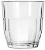
Rocks No. 15369 + 7 oz./21.0 cl./210 ml. H3¾ T3 B2½ D3 1 doz./6# • .30 cu.ft. SCC 6943949902506 TRAEX TR-12H □