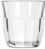
Rocks No. 15368 + 9 oz./26.6 cl./266 ml. H3½ T3¼ B2¾ D3¼ 1 doz./7# • .40 cu.ft. SCC 6943949902513 TRAEX TR-6B □