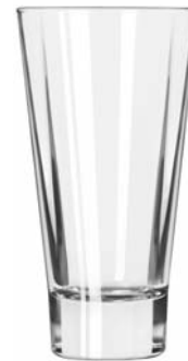
Cooler No. 15826 + 16 oz./47.3 cl./473 ml. H6¾ T3¾ B2¼ D3¾ 1 doz./17# • .74 cu.ft. SCC 400109 TRAEX TR-11GGG □