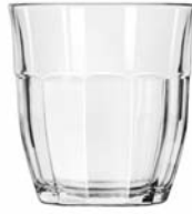
Double Rocks No. 15367 + 12 oz./35.5 cl./355 ml. H3¾ T3¾ B2½ D3¾ 1 doz./10# • .50 cu.ft. SCC 6943949902520 TRAEX TR-11G □