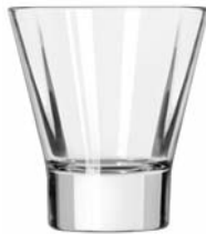
Rocks No. 15822 + 11 oz./32.5 cl./325 ml. H4¾ T3¾ B2¾ D3¾ 1 doz./12# • .59 cu.ft. SCC 400215 TRAEX TR-8D □