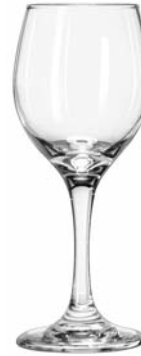
Wine No. 3065 ■ 8 oz./23.7 cl./237 ml. H7¼ T2½ B2¾ D3 2 doz./13# = 1.10 cu.ft. SCC 027986 TRAEX TR-12HHH □