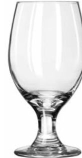
Banquet Goblet No. 3010 ■ 14 oz./41.4 cl./414 ml. H6½ T2¾ B3 D3¾ 2 doz./17# = 1.33 cu.ft. SCC 055118 TRAEX TR-6BBB □