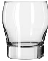
Double Old Fashioned No. 2394 ● 12 oz./35.5 cl./355 ml. H4½ T3½ B2¾ D3½ 2 doz./19# • .91 cu.ft. SCC 059048 TRAEX TR-6B □