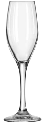
Flute No. 3096 ■ 5¾ oz./17.0 cl./170 ml. H8½ T1½ B2¾ D2¾ 1 doz./6# = .57 cu.ft. SCC 252340 TRAEX TR-7CCC □