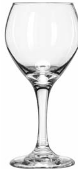
Red Wine No. 3056 ■ 10 oz./29.6 cl./296 ml. H7½ T2¾ B2¾ D3¾ 2 doz./13# = 1.38 cu.ft. SCC 026309 TRAEX TR-6BBB □