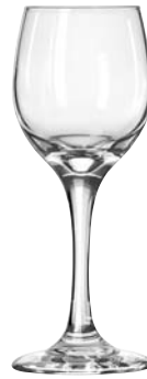
White Wine No. 3058 ■ 6½ oz./19.2 cl./192 ml. H7 T2½ B2¾ D3¼ 2 doz./11# = .96 cu.ft. SCC 047311 TRAEX TR-7CCC □