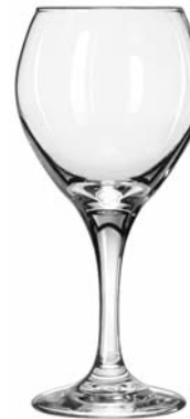
Red Wine No. 3014 ■ 13½ oz./39.9 cl./399 ml. H7¾ T2½ B3 D3¾ 2 doz./16# = 1.75 cu.ft. SCC 028402 TRAEX TR-11GGG □