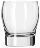
Rocks No. 2391 ● 7 oz./20.7 cl./207 ml. H3¾ T2¾ B2¾ D3 2 doz./13# • .57 cu.ft. SCC 059017 TRAEX TR-7C □