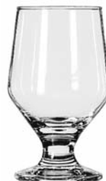
Footed All Purpose Goblet No. 3312 ■ 10½ oz./31.1 cl./311 ml. H5¼ T2½ B2¾ D3½ 3 doz./21# • 1.43 cu.ft. SCC 054893 TRAEX TR-12HH □