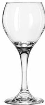
Red Wine No. 3064 ■ 8 oz./23.7 cl./237 ml. H7 T2½ B2¾ D3½ 2 doz./12# = 1.17 cu.ft. SCC 028273 TRAEX TR-12HHH □