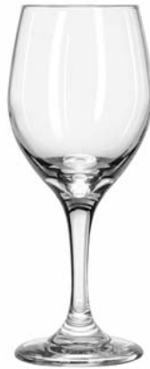
Tall Goblet No. 3011 ■ 14 oz./41.4 cl./414 ml. H8¼ T2¾ B3 D3¾ 2 doz./18# = 1.63 cu.ft. SCC 027924 TRAEX TR-6BBBB □