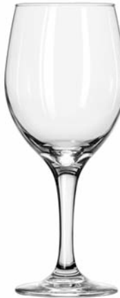
Tall Wine No. 3060 ■ 20 oz./59.2 cl./592 ml. H8½ T3½ B3¼ D3¾ 1 doz./10# = 1.10 cu.ft. SCC 077561 TRAEX TR-11GGGG □