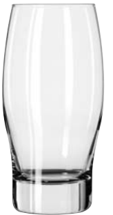
Cooler No. 2396 ● 16 oz./47.3 cl./473 ml. H6¾ T2½ B2¾ D3½ 2 doz./18# • 1.05 cu.ft. SCC 059062 TRAEX TR-12HH □