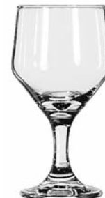
Wine No. 3364 ■ 8½ oz./25.1 cl./251 ml. H5½ T2½ B2¾ D3½ 3 doz./20# • 1.57 cu.ft. SCC 056552 TRAEX TR-12HH □