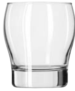
Rocks No. 2392 ● 9 oz./26.6 cl./266 ml. H3¾ T2½ B2½ D3½ 2 doz./17# • .73 cu.ft. SCC 059024 TRAEX TR-12H □