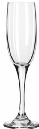
Tall Flute No. 4196SR ✕■ 6 oz./17.7 cl./177 ml. H8¾ T2 B2¾ D2¾ 2 doz./12# • 1.16 cu.ft. SCC 878390 TRAEX TR-7CCCC □