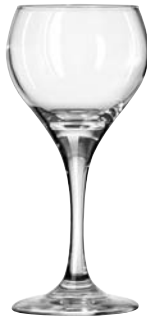
Red Wine No. 3069 ■ 6½ oz./19.2 cl./192 ml. H6½ T2½ B2¾ D3 2 doz./11# = 1.04 cu.ft. SCC 044020 TRAEX TR-13HHH □