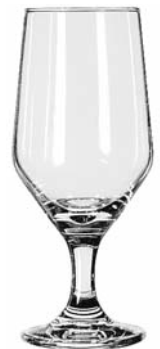
Beer No. 3328 ■ 12 oz./35.5 cl./355 ml. H7½ T2½ B2¾ D3½ 3 doz./23# • 1.79 cu.ft. SCC 056682 TRAEX TR-12HHH □