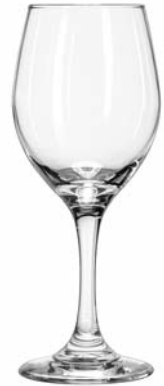
Wine No. 3057 ■ 11 oz./32.5 cl./325 ml. H7½ T2½ B2¾ D3½ 2 doz./14# = 1.33 cu.ft. SCC 019561 TRAEX TR-12HHH □