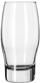
Beverage No. 2393 ● 12 oz./35.5 cl./355 ml. H5¾ T2¾ B2¼ D2½ 2 doz./16# • .85 cu.ft. SCC 059031 TRAEX TR-7CC □