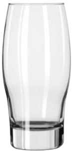
Beverage No. 2395 ● 14 oz./41.4 cl./414 ml. H6½ T2½ B2¾ D3 2 doz./18# • .97 cu.ft. SCC 059055 TRAEX TR-12HH □