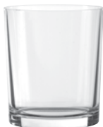
Whiskey No. 2660115 9¼ oz./290 ml. H3⅝ T3 B2¾ D3 1 doz./7# • .55 cu. ft. SCC 4003322243274

Like an afternoon at the club, these are comfortably sophisticated. A cut above the ordinary while possessing a relaxing familiarity.