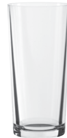
Highball No. 2660113 11¼ oz./350 ml. H5¼ T2⅝ B2⅝ D2⅞ 1 doz./10# • .66 cu. ft. SCC 4003322243311