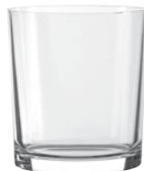
DOF No. 2660116 12½ oz./370 ml. H3¾ T3⅝ B3 D3⅝ 1 doz./9# • .55 cu. ft. SCC 4003322217398