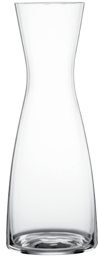
Classic Bar Carafe No. 9008057 37¼ oz./1100 ml. H10¼ T3¼ B3⅝ D3⅞ 1 doz./10# • 1.33 cu. ft. SCC 4003322253655