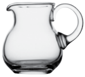
Bodega Pitcher No. 8780047 (N) 3½ oz./104 ml. H2⅞ T2¼ B1¼ D3⅜ 6 pcs./2# • .25 cu. ft. SCC 4003322043591