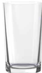
Highball No. 2660114 9¼ oz./290 ml. H4⅞ T2⅝ B2⅝ D2⅞ 1 doz./8# • .41 cu. ft. SCC 4003322217411