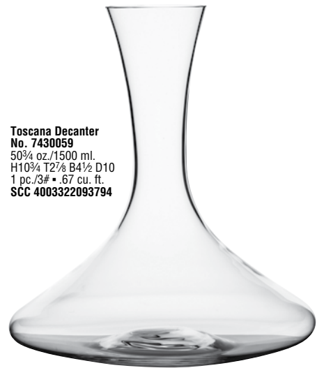
Toscana Decanter No. 7430059 50¾ oz./1500 ml. H10¾ T2⅞ B4½ D10 1 pc./3# • 67 cu. ft. SCC 4003322093794

FESTIVAL | CARAFES & DECANTERS | SPIEGELAU | NACHTMANN