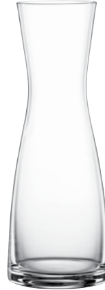
Classic Bar Carafe No. 9008055 20¼ oz./600 ml. H8⅝ T2½ B3¼ D3¼ 1 doz./8# • .99 cu. ft. SCC 4003322253631