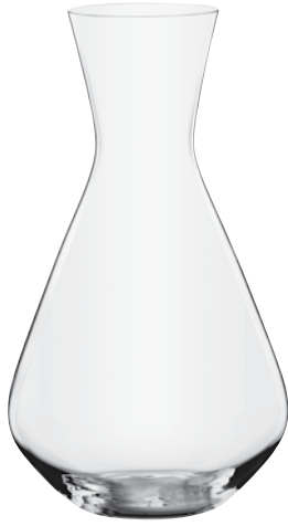
Casual Entertaining Decanter No. 4800188 47¼ oz./1400 ml. H9½ T2¾ B2½ D5⅜ 1 pc./2# • .22 cu. ft. SCC 4003322124818