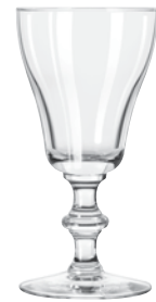
Georgian Irish Coffee No. 8054 6 oz./17.7 cl./177 ml. H5¼ T2½ B2¾ D2½ 3 doz./15# • 1.25 cu. ft. SCC 435095