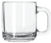
Mug No. 5201 10 oz./29.6 cl./296 ml. H3½ T3½ B2¾ D4½ 1 doz./10# • .44 cu. ft. SCC 708673