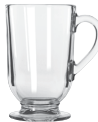
Irish Coffee No. 5304 10½ oz./31.1 cl./311 ml. H5 T3½ B2¾ D4¼ 1 doz./12# • .49 cu. ft. SCC 840298