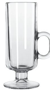
Irish Coffee No. 5292 8 oz./23.7 cl./237 ml. H6½ T2¾ B2¾ D3¾ 2 doz./25# • 1.06 cu. ft. SCC 878161