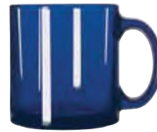
Mug No. 5213B 13 oz./38.5 cl./385 ml. H3¾ T3¾ B3¾ D4¾ 1 doz./13# • .52 cu. ft. SCC 310869