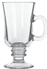
Irish Coffee No. 5295 8½ oz./25.1 cl./251 ml. H5½ T3½ B2¾ D4½ 2 doz./21# • 1.13 cu. ft. SCC 030101