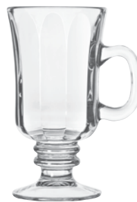
Irish Coffee with optic No. 5294 8¼ oz./24.4 cl./244 ml. H5½ T3½ B2¾ D4½ 2 doz./22# • 1.13 cu. ft. SCC 057986