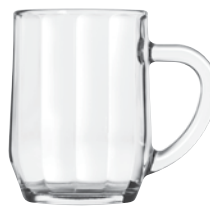
All Purpose Optic Mug No. 5725 10 oz./29.6 cl./296 ml. H4½ T2½ B2¾ D4¾ 3 doz./30# • 1.37 cu. ft. SCC 373557