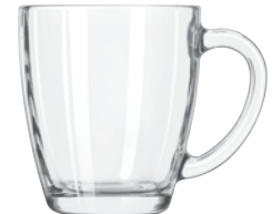
Square Mug No. 5352 14 oz./41.4 cl./414 ml. H4 T3½ B2½ D4¾ 1 doz./10# • .68 cu. ft. SCC 394583