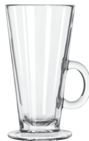
Irish Coffee No. 5293 8½ oz./25.1 cl./251 ml. H5½ T3 B2¾ D3¾ 2 doz./21# • 1.04 cu. ft. SCC 878154