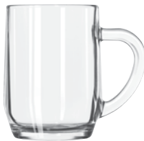
All Purpose Mug No. 5724 10 oz./29.6 cl./296 ml. H4½ T2½ B2¾ D4½ 3 doz./30# • 1.37 cu. ft. SCC 373540