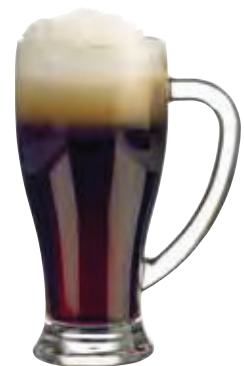
Cafe Mug No. 5286 14 oz./41.4 cl./414 ml. H6¾ T3½ B2¾ D5 1 doz./17# • .86 cu. ft. SCC 592061