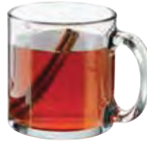
Mug No. 5213 13 oz./38.5 cl./385 ml. H3¾ T3¾ B3¾ D4¾ 1 doz./13# • .52 cu. ft. SCC 886531