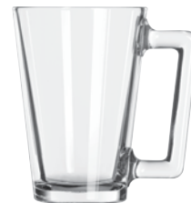
All Purpose Mug No. 5589 9 oz./26.6 cl./266 ml. H4½ T3½ B2½ D4¼ 2 doz./21# • 1.01 cu. ft. SCC 308160

Thermal shock, taking a cold glass and pouring a hot beverage into it, can damage glassware. It is recommended to pre-heat the glassware before adding a steaming hot beverage.