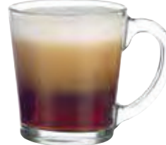
All Purpose Mug No. 5544 13½ oz./39.9 cl./399 ml. H4½ T3½ B2¾ D5 1 doz./11# • .64 cu. ft. SCC 269673