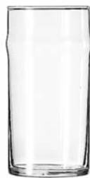
Iced Tea No. 1906HT ●★ 12 oz./35.5 cl./355 ml. H5½ T2½ B2½ D2¾ 6 doz./28# • 1.89 cu.ft. SCC 014033 TRAEX TR-7CA □