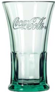
Coca-Cola Footed Flare No. 5703CC 16 oz./47.3 cl./473 ml. H6¾ T3¾ B3 D3¾ 1 doz./18# • 87 cu.ft. SCC 280190 TRAEX TR-11GGG □