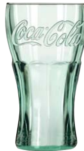
Coca-Cola Genuine Tumbler No. 2216CC 16¾ oz./49.5 cl./495 ml. H6½ T3¼ B2½ D3¾ 1 doz./9# • 63 cu.ft. SCC 280081 TRAEX TR-11GG □