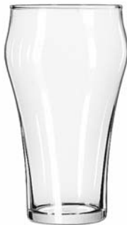
Bell Soda No. 539HT ●★ 21 oz./62.1 cl./621 ml. H6½ T3¾ B2¾ D3¾ 3 doz./31# • 2.29 cu.ft. SCC 564934 TRAEX TR-11GGA □

Use one of Libbey's Coca-Cola® glasses and get a smile from your customers.