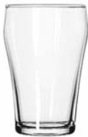
Bell Fountain Tumbler No. 30 ● 6¾ oz./20.0 cl./200 ml. H4 T2½ B1¾ D2½ 6 doz./24# • 1.24 cu.ft. SCC 508297 TRAEX TR-13MMM □