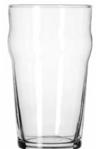
English Pub Glass No. 14801HT ●★ 20 oz./59.2 cl./592 ml. H6 T3¾ B2¾ D3½ 3 doz./28# • 1.88 cu.ft. SCC 580118 TRAEX TR-6BB □