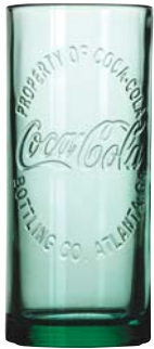
new Hutchinson Coke Cooler No. 5732CC 16½ oz./48.8 cl./488 ml. H6¾ T3 B3 D3 1 doz./17# • 52 cu.ft. SCC 417015 TRAEX TR-6BBB □

COKE® brand glassware is produced for The Coca-Cola Company, owner of the trademarks COCA-COLA, COKE, the design of the contour glass, and Always Coca-Cola by Libbey Inc., an authorized user. ©The Coca-Cola Company. All rights reserved.