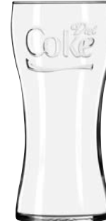
new Diet Coke Tumbler No. 2116 ● 17 oz./50.3 cl./503 ml. H6¾ T3 B2¾ D3¼ 1 doz./9# • 60 cu.ft. SCC 430519 TRAEX TR-6BBB □