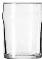
Water No. 1910HT ●★ 10 oz./29.6 cl./296 ml. H3¾ T2¾ B2¾ D2¾ 4 doz./15# • 1.17 cu.ft. SCC 359963 TRAEX TR-7C □