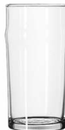
Regency Rockwall Beer No. 1907HT ●★ 12¾ oz./37.7 cl./377 ml. H5½ T2½ B2½ D2¾ 6 doz./37# • 2.16 cu.ft. SCC 613448 TRAEX TR-7CA □