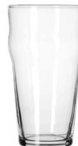
English Pub Glass No. 14806HT ●★ 16 oz./47.3 cl./473 ml. H6 T3½ B2¼ D3¼ 3 doz./24# • 1.60 cu.ft. SCC 005144 TRAEX TR-6BB □