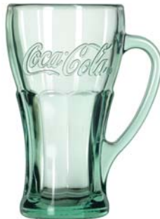
Coca-Cola Genuine Mug No. 5705CC 14½ oz./42.9 cl./429 ml. H6¾ T3¾ B2½ D4¾ 1 doz./20# • 87 cu.ft. SCC 281852 TRAEX TR-4DDD □