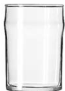
Beverage No. 1917HT ●★ 7¾ oz./22.9 cl./229 ml. H3¾ T2½ B2¾ D2½ 6 doz./24# • 1.35 cu.ft. SCC 056880 TRAEX TR-13MMA □