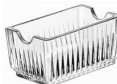
4¼" Sugar Package Holder No. 5460 H2½ T4¼ B3½ D4¼ 2 doz./16# • .47 cu.ft. SCC 846368 TRAEX TR-7C □