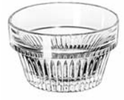
Ramekin No. 15447 + 5 oz./14.8 cl./148 ml. H2 T3¾ B2¼ D3¾ 3 doz./12# • .59 cu.ft. SCC 826995 TRAEX TR-16 □