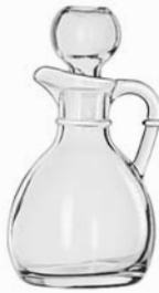
Cruet w/Stopper No. 75305 6 oz./17.7 cl./177 ml. H4½ T1½ B1¼ D2⅞ 1 doz./7# • .44 cu.ft. SCC 849086 TRAEX TR-7C □