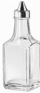
Oil and Vinegar Cruet Stainless Steel Top No. 75391 4 oz./11.8 cl./118 ml. H5½ T1½ B2½ D2⅞ 1 doz./7# • .24 cu.ft. SCC 039746 TRAEX TR-9EE □