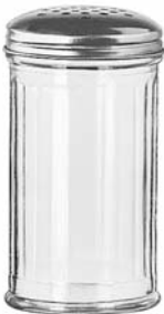
Cheese Shaker Stainless Steel Top No. 70140 12 oz./35.5 cl./355 ml. H5 3/4 T3 B3 D3 2 doz./20# • 1.00 cu.ft. SCC 112913 TRAEX TR-12HH □