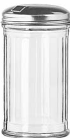
Sugar Pourer Stainless Steel Top No. 70141 12 oz./35.5 cl./355 ml. H5 3/4 T3 B3 D3 2 doz./20# • 1.00 cu.ft. SCC 112920 TRAEX TR-12HH □