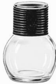
Server No. 5065 11½ oz./34.5 cl./345 ml. H4¾ T2½ B2¾ D3¼ 2 doz./8# • .94 cu.ft. SCC 171866 TRAEX TR-6B □