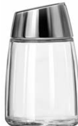
new Continental Slant Sugar Pourer w/Chrome Top No. L-930 12 oz./35.5 cl./355 ml. H5 1/8 T2 B2 1/8 D3 1/8 1 doz./14# • .23 cu.ft. SCC 344090 TRAEX TR-12H □