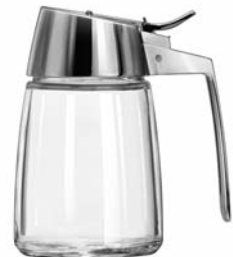
new Continental Syrup Server w/Chrome Top No. L-912 12 oz./35.5 cl./355 ml. H5 1/8 T2 B2 1/8 D4 3/4 1 doz./10# • .34 cu.ft. SCC 344120 TRAEX TR-12H □