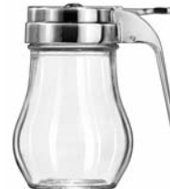
new Syrup Server w/Chrome Top No. L-206 6 oz./17.7 cl./177 ml. H4 1/8 T1 1/8 B2 D3 3/8 1 doz./6# • .36 cu.ft. SCC 344106 TRAEX TR-7C □