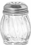
Cheese Shaker Stainless Steel Top No. 70132 5 3/4 oz./17.0 cl./170 ml. H3 5/8 T2 3/8 B2 1/8 D2 3/4 3 doz./13# • .83 cu.ft. SCC 093892 TRAEX TR-7A □