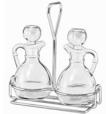
3-pc. Cruet Set No. 80371 H7½ T½ B7 D7 6 sets/shipper/13# • 1.95 cu.ft. SCC 849093