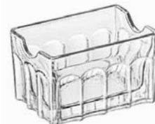
3½" Sugar Package Holder No. 5258 H2½ T3½ B3½ D3½ 2 doz./11# • .35 cu.ft. SCC 177363 TRAEX TR-7A □