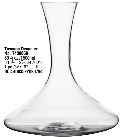
Toscana Decanter No. 7430059 50¾ oz./1500 ml. H10¾ T2⅞ B4½ D10 1 pc./3# • 67 cu. ft. SCC 4003322093794

FESTIVAL | CARAFES & DECANTERS | SPIEGELAU | NACHTMANN