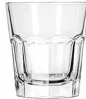
Double Rocks No. 15233 + 13 oz./38.5 cl./385 ml. H4½ T3¾ B2¾ D3¾ 3 doz./32# • 1.51 cu.ft. SCC 105380 TRAEX TR-11G □