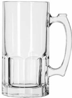
Super Mug No. 5262 34 oz./99.8 cl./998 ml. H8 T4 B4 D6 1 doz./39# • 1.50 cu.ft. SCC 001392 TRAEX TR-10FFA □