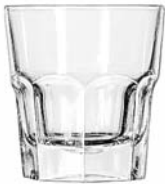
Tall Rocks No. 15231 + 9 oz./26.6 cl./266 ml. H3½ T3½ B2½ D3½ 3 doz./29# • 1.19 cu.ft. SCC 105366 TRAEX TR-6B □