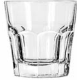
Rocks No. 15241 + 7 oz./20.7 cl./207 ml. H3¼ T3½ B2¼ D3½ 3 doz./18# • .85 cu.ft. SCC 733088 TRAEX TR-12A □