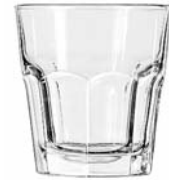
Rocks No. 15242 + 9 oz./26.6 cl./266 ml. H3½ T3½ B2½ D3½ 3 doz./22# • 1.07 cu.ft. SCC 733187 TRAEX TR-6A □