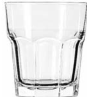
Double Rocks No. 15243 + 12 oz./35.5 cl./355 ml. H4 T3½ B2¾ D3¾ 3 doz./27# • 1.30 cu.ft. SCC 733200 TRAEX TR-11G □