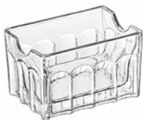
3½" Sugar Package Holder No. 5258 H2½ T3½ B3½ D3½ 2 doz./11# • 35 cu.ft. SCC 177363 TRAEX TR-7A □