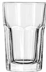
Beverage No. 15237 + 10 oz./29.6 cl./296 ml. H4¾ T3½ B2½ D3½ 3 doz./31# • 1.18 cu.ft. SCC 056712 TRAEX TR-12HA □