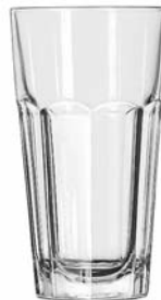
Beverage No. 15383 + 10½ oz./31.1 cl./311 ml. H5½ T3 D3 1 doz./10# • .43 cu.ft. SCC 6943949907051 TRAEX TR-12HH □