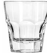
Rocks No. 15240 + 8 oz./23.7 cl./237 ml. H3½ T3½ B2½ D3½ 3 doz./27# • 1.07 cu.ft. SCC 007691 TRAEX TR-6B □