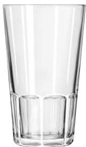
Mixing Glass No. 15230 + 16 oz./47.3 cl./473 ml. H5½ T3½ B2½ D3½ 2 doz./26# • 1.27 cu.ft. SCC 025791 TRAEX TR-6BB □