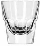
Rocks No. 15248 + 4½ oz./13.3 cl./133 ml. H3½ T3 B2½ D3 3 doz./21# • .71 cu.ft. SCC 109005 TRAEX TR-7 □