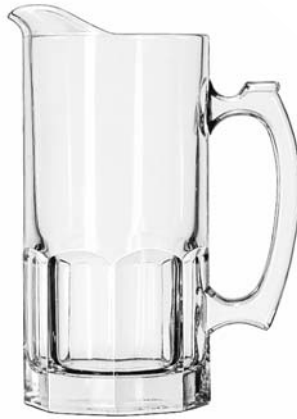
Liter Pitcher No. 5263 34 oz./99.8 cl./998 ml. H8½ T4 B4 D6¼ 1 doz./38# • 1.61 cu.ft. SCC 001408 TRAEX TR-10FFFA □