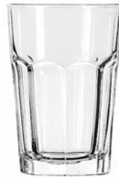
Beverage No. 15244 + 14 oz./41.4 cl./414 ml. H5½ T3½ B2¾ D3½ 3 doz./37# • 1.60 cu.ft. SCC 733224 TRAEX TR-6BB □