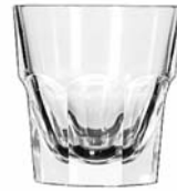
Tall Rocks No. 15245 + 7 oz./20.7 cl./207 ml. H3½ T3¼ B2½ D3¼ 3 doz./26# • .97 cu.ft. SCC 109012 TRAEX TR-6A □