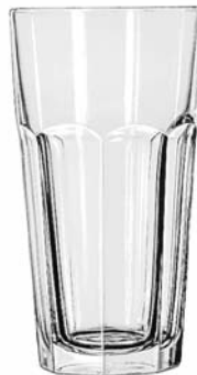
Iced Tea No. 15253 + 22 oz./65.1 cl./651 ml. H7 T3¾ B2¾ D3¾ 2 doz./38# • 1.72 cu.ft. SCC 867462 TRAEX TR-11GGG □