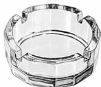
Gibraltar Ashtray No. 5172 4" 3 doz./24# • .71 cu.ft. SCC 023455 TRAEX TR-3 □