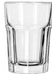
Beverage No. 15238 + 12 oz./35.5 cl./355 ml. H4¾ T3¼ B2½ D3¼ 3 doz./36# • 1.39 cu.ft. SCC 056729 TRAEX TR-6BA □