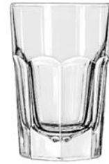
Hi-Ball No. 15236 + 9 oz./26.6 cl./266 ml. H4¼ T3½ B2½ D3½ 3 doz./33# • 1.18 cu.ft. SCC 057979 TRAEX TR-12HA □