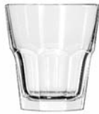
Rocks No. 15249 + 5½ oz./16.3 cl./163 ml. H3½ T3 B2½ D3 3 doz./16# • .73 cu.ft. SCC 108992 TRAEX TR-12 □