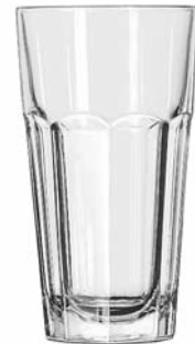
Cooler No. 15256 + 16 oz./47.3 cl./473 ml. H6¾ T3½ B2½ D3½ 2 doz./29# • 1.31 cu.ft. SCC 063403 TRAEX TR-6BB □