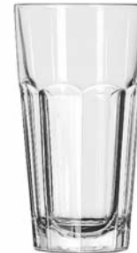
Cooler No. 15235 + 12 oz./35.5 cl./355 ml. H5½ T3½ B2¼ D3½ 3 doz./32# • 1.47 cu.ft. SCC 142477 TRAEX TR-12HH □