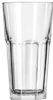
Cooler No. 15665 + 20 oz./59.2 cl./592 ml. H6¾ T3¾ B2¾ D3¾ 2 doz./29# • 1.57 cu.ft. SCC 063267 TRAEX TR-11GGG □