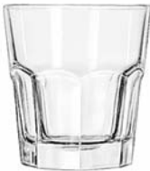
Rocks No. 15232 + 10 oz./29.6 cl./296 ml. H3½ T3½ B2½ D3½ 3 doz./27# • 1.19 cu.ft. SCC 105373 TRAEX TR-6B □