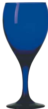
Teardrop Goblet No. 3911B ■ 12 oz./35.5 cl./355 ml. H7¼ T2½ B2¾ D3¾ 1 doz./8# = .71 cu.ft. SCC 451651 TRAEX TR-6BBB □