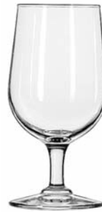
Citation Banquet Goblet No. 8411 ● 11 oz./32.5 cl./325 ml. H6 T2½ B2¾ D3 3 doz./17# • 1.48 cu.ft. SCC 129164 TRAEX TR-6BB □