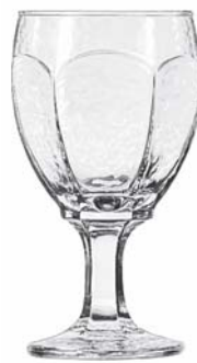
Chivalry Goblet No. 3212 ■ 12 oz./35.5 cl./355 ml. H6½ T3¼ B3 D3¾ 3 doz./30# = 2.16 cu.ft. SCC 716128 TRAEX TR-13BBB □