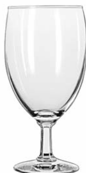
Napa Country Iced Tea No. 8716 ● 16¼ oz./48.1 cl./481 ml. H7 T3¾ B2¾ D3½ 3 doz./22# = 2.18 cu.ft. SCC 520244 TRAEX TR-6BBB □