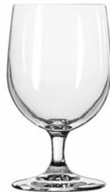
Bristol Valley Goblet No. 8556SR ✖ 12 oz./35.5 cl./355 ml. H5½ T3 B2¾ D3⅝ 2 doz./13# • 1.01 cu.ft. SCC 457250 TRAEX TR-6BB □