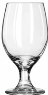
Perception Banquet Goblet No. 3010 ■ 14 oz./41.4 cl./414 ml. H6½ T2¾ B3 D3⅝ 2 doz./17# • 1.33 cu.ft. SCC 055118 TRAEX TR-6BBB □