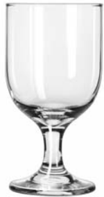
Embassy Goblet No. 3756 ■ 10¼ oz./30.3 cl./303 ml. H5¼ T3 B2¾ D3 2 doz./12# • .94 cu.ft. SCC 370075 TRAEX TR-12HH □