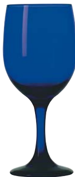
Première Goblet No. 4111SRB/UPC00 ✕■ 11½ oz./34.0 cl./340 ml. H7½ T2½ B2¾ D3¼ 1 doz./7# = .65 cu.ft. SCC 555700 TRAEX TR-6BBB □