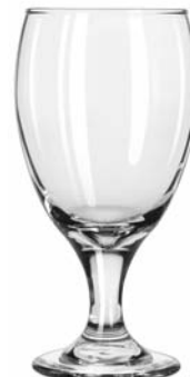
Embassy Royale Iced Tea No. 3716 ■ 16¼ oz./48.1 cl./481 ml. H7 T3¼ B3 D3½ 3 doz./28# = 2.31 cu.ft. SCC 516766 TRAEX TR-6BBB □