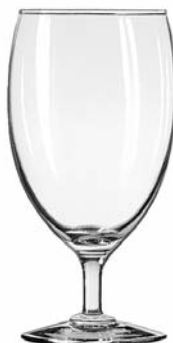
Citation Iced Tea No. 8439 ● 16½ oz./48.8 cl./488 ml. H7 T3¾ B2¾ D3½ 1 doz./8# = .74 cu.ft. SCC 018410 TRAEX TR-6BBB □