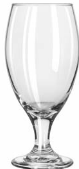
Teardrop Beer No. 3915 ■ 14¾ oz./43.6 cl./436 ml. H7 T2½ B2¾ D3¼ 3 doz./23# • 1.89 cu.ft. SCC 563098 TRAEX TR-6BBB □