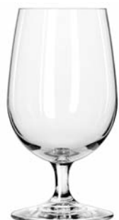
Bristol Valley Iced Tea No. 8513SR ✕■ 16 oz./47.3 cl./473 ml. H6¾ T2¾ B3¼ D3½ 2 doz./13# = 1.32 cu.ft. SCC 321367 TRAEX TR-6BBB □