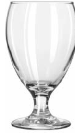
Teardrop Goblet No. 3914 ■ 10½ oz./31.1 cl./311 ml. H5½ T3 B2¾ D3¼ 3 doz./18# • 1.50 cu.ft. SCC 497300 TRAEX TR-12HH □