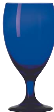
Première Tall Iced Tea No. 4116SRB/UPC00 ✕■ 16¼ oz./48.1 cl./481 ml. H7 T3¼ B3 D3½ 1 doz./9# = .78 cu.ft. SCC 555588 TRAEX TR-6BBB □