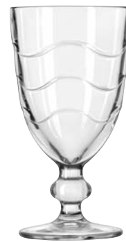
Cantina Goblet No. 5685 15 oz./44.4 cl./444 ml. H7 T3¼ B3¼ D3¾ 1 doz./14# = .89 cu.ft. SCC 038777 TRAEX TR-11GGG □