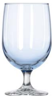
Montibello Iced Tea Misty Blue Bowl No. 8512A4 ● 16 oz./47.3 cl./473 ml. H6¼ T3¾ B3 D3½ 1 doz./8# = .66 cu.ft. SCC 259912 TRAEX TR-6BB □