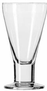
Catalina Goblet No. 3821 ■ 10½ oz./31.1 cl./311 ml. H6¼ T3¾ B3 D3¾ 3 doz./27# = 1.82 cu.ft. SCC 200740 TRAEX TR-6BB □