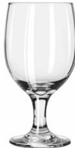
Embassy Goblet No. 3711 ■ 11½ oz./34.0 cl./340 ml. H6½ T2¾ B2¾ D3¼ 2 doz./13# • 1.07 cu.ft. SCC 369987 TRAEX TR-12HH □