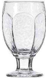
Chivalry Banquet Goblet No. 3211 ■ 10½ oz./31.1 cl./311 ml. H5½ T2¾ B2¾ D3¼ 2 doz./14# • .96 cu.ft. SCC 369970 TRAEX TR-12HH □