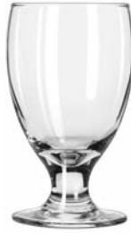
Embassy Banquet Goblet No. 3712 ■ No. 3752HT ★■ 10½ oz./31.1 cl./311 ml. H5¼ T2¾ B2¾ D3⅛ 2 doz./14# • .93 cu.ft. No. 3712-SCC 369994 No. 3752HT-SCC 370068 TRAEX TR-6BB □