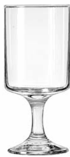
Lexington Goblet No. 3556 ■ 11 oz./32.5 cl./325 ml. H6¼ T2½ B2½ D2¾ 3 doz./20# = 1.32 cu.ft. SCC 508273 TRAEX TR-7CC □