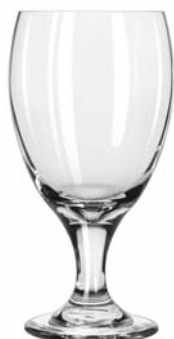
Charisma Tall Iced Tea No. 4116SR ✕■ 16¼ oz./48.1 cl./481 ml. H7 T3¼ B3 D3½ 2 doz./18# = 1.55 cu.ft. SCC 451333 TRAEX TR-6BBB □