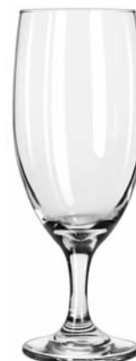
Embassy Royale Tall Iced Tea No. 3750 ■ 16 oz./47.3 cl./473 ml. H8¾ T2¾ B3 D3 3 doz./24# = 2.18 cu.ft. SCC 858934 TRAEX TR-6BBB □