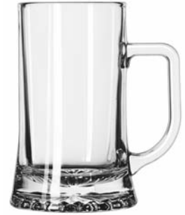
Maxim Mug No. 2329SA450 17½ oz./52.0 cl./520 ml. H6½ T3¼ B3½ D5½ 1 doz./26# • 1.17 cu.ft. SCC 368140 TRAEX TR-4DDD □