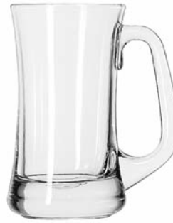
Scandinavia No. 5298 15 oz./44.4 cl./444 ml. H6¼ T3¾ B3½ D5½ 1 doz./24# • .93 cu.ft. SCC 031979 TRAEX TR-4DD □