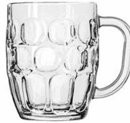
Dimple Stein No. 5355 19¼ oz./56.9 cl./569 ml. H4¾ T3¾ B2¾ D5¾ 2 doz./33# • 1.64 cu.ft. SCC 508365 TRAEX TR-10FA □