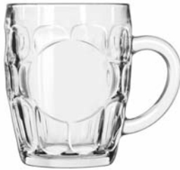
Sintra Mug No. 2187X1155 18½ oz./55.0 cl./550 ml. H4¾ T3¾ B2¾ D5¾ 1 doz./17# • .67 cu.ft. SCC 370877 TRAEX TR-18JA □