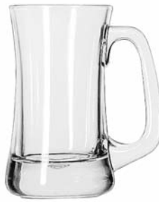
Scandinavia No. 5297 12 oz./35.5 cl./355 ml. H5½ T3½ B3¾ D4¾ 1 doz./20# • .77 cu.ft. SCC 031962 TRAEX TR-4DD □