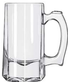
Stein No. 5205 10 oz./29.6 cl./296 ml. H5½ T2¾ B3¼ D4½ 1 doz./26# • .76 cu.ft. SCC 625178 TRAEX TR-4DD □