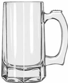
Stein No. 5206 12 oz./35.5 cl./355 ml. H5½ T2¾ B3¼ D4½ 1 doz./23# • .76 cu.ft. SCC 625185 TRAEX TR-4DD □