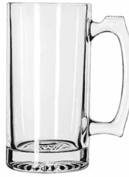
Sport Mug No. 5272 25 oz./73.9 cl./739 ml. H7½ T3¾ B3¾ D5½ 1 doz./34# • 1.13 cu.ft. SCC 863884 TRAEX TR-10FFA □