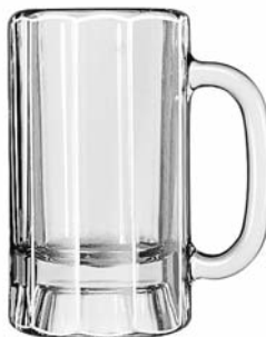
Paneled Mug No. 5018 14 oz./41.4 cl./414 ml. H6½ T3½ B3½ D5 1 doz./30# • .88 cu.ft. SCC 466863 TRAEX TR-4DD □