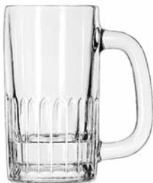
Mug No. 5307 8½ oz./25.1 cl./251 ml. H5¾ T2½ B2¾ D4¾ 2 doz./36# • 1.05 cu.ft. SCC 039869 TRAEX TR-5AA □