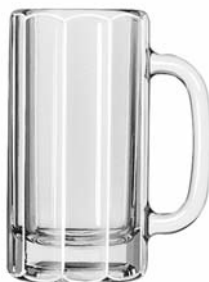
Paneled Mug No. 5016 12 oz./35.5 cl./355 ml. H5½ T3¾ B3¼ D5½ 1 doz./26# • .81 cu.ft. SCC 572366 TRAEX TR-4DD □