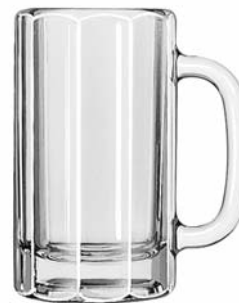
Paneled Mug No. 5020 16 oz./47.3 cl./473 ml. H6½ T3½ B3½ D5 1 doz./27# • .88 cu.ft. SCC 890057 TRAEX TR-4DD □