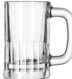
Mug No. 5364 12 oz./35.5 cl./355 ml. H5½ T3¼ B3¼ D5½ 1 doz./24# • .75 cu.ft. SCC 053725 TRAEX TR-4DD □