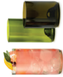
Recycled Wine Bottle State social responsibility with a drinking vessel 12 oz. and 16 oz. sizes in Clear, Green, Dark Olive and Blue (not shown) Available in May