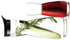
Ensemble Carafe Differentiate with sophisticated water service 36 oz. – No. 927634 11 oz. – No. 928044