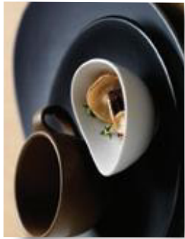
World® Tableware – Driftstone Dinnerware Mix and match organic place settings for meaningful moments