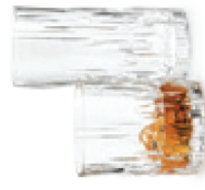
Nachtmann Shu Fa Bring modern luxury to traditional pours 11 1/2 oz. Whiskey – No. N98151 12 1/4 oz. Longdrink – No. N98152

8 1/2 oz. – No. 440102 Available late March