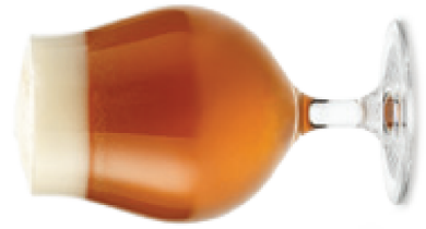
CIRCA™ BELGIAN ALE 13 oz. – No. 9170