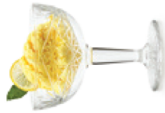
Hobstar Coupe Glamorize cocktail culture creations 8 1/2 oz. – No. 929799