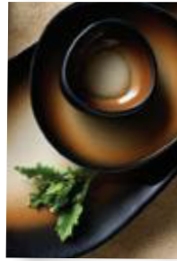
World® Tableware – Pebblebrook Dinnerware Serve locally sourced entrées on organic-shaped dinnerware