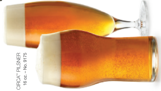
CIRCA™ PILSNER 16 oz. – No. 9175