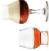
Master's Reserve® Bourbon Taster Heighten the flavor experience, one sip at a time 8 oz. – No. 9196 Available late April