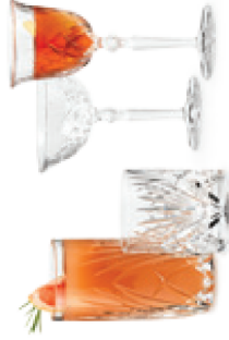
Nachtmann Palais Accent spirits with brilliant cut design 8 oz. DOF – No. N97210 12 oz. DOF – No. N97211 15 1/2 oz. Longdrink – No. N97207 6 1/2 oz. Cocktail – No. N97212 7 1/4 oz. White Wine – No. N92952