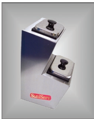
Side Mount Syrup Rail - Item 188409