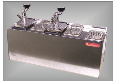
Front Mount Syrup Rail - Item 188146