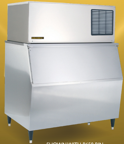
SHOWN WITH B650 BIN

ice Machines • bins • crushers • dispensers