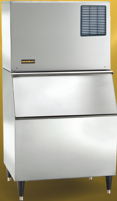
SHOWN WITH B400 BIN

ice Machines • bins • crushers • dispensers