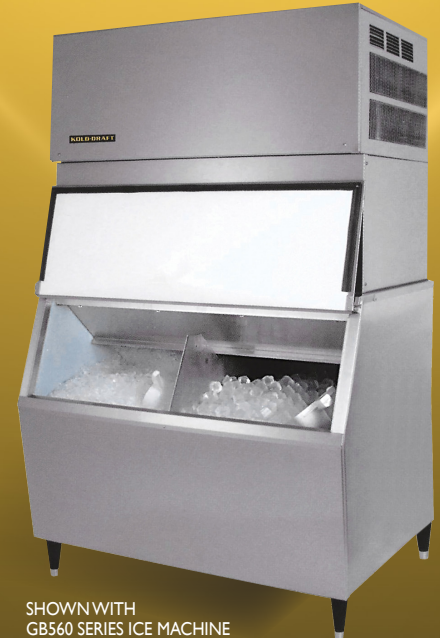
SHOWN WITH GB560 SERIES ICE MACHINE AND B650D BIN

Ice Machines • bins • crushers • dispensers