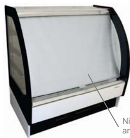
Night curtain standard and front brackets