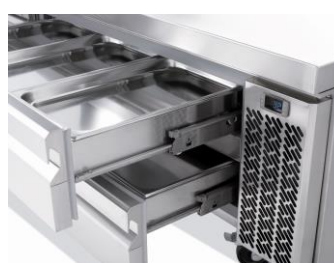
Heavy-duty stainless steel drawer slides designed to hold up to 440 Lbs. (Pans Not Included)