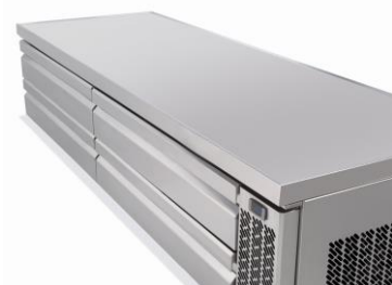
AISI 304 Stainless Steel worktop with drip guard marine edge, standard.