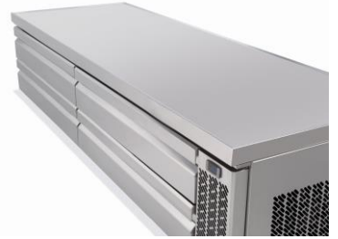
AISI 304 Stainless Steel worktop with drip guard marine edge, standard.