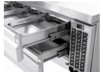
Heavy-duty stainless steel drawer slides designed to hold up to 440 Lbs. (Pans Not Included)