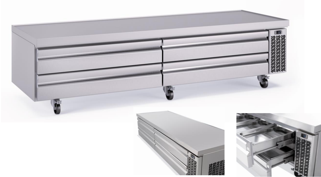
AISI 304 Stainless Steel worktop with drip guard marine edge, standard.