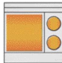
TRE36C5/D5 • One 12" x 24" x 1/2" griddle plate • Two round hotplates