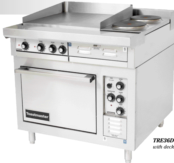
TRE36D5 with deck oven base