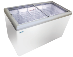
With optional baskets