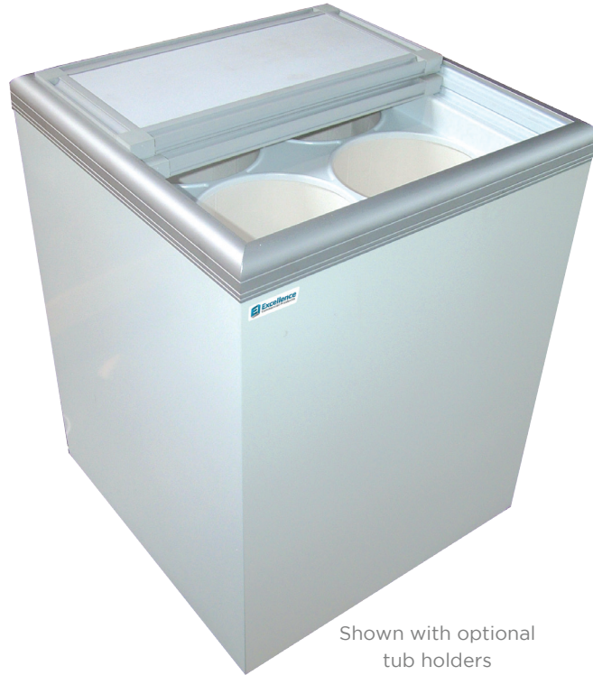
Shown with optional tub holders